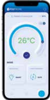
Set-point temperature adjustment, notification when temperature has been reached, alert message