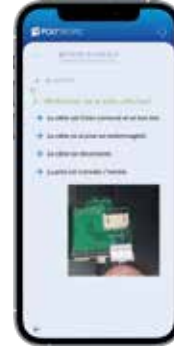
Frequently asked questions, video tutorials, technical manuals