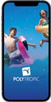
At-a-glance overview of the status of all connected pool equipment

A MUST-HAVE FOR YOUR CONNECTED CUSTOMERS WHO WANT TO CONTROL THEIR DEVICES AT A GLANCE!