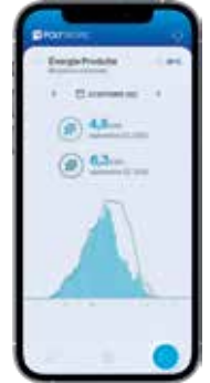
Real-time self-generation / consumption quota (if PolySolar photovoltaic system)