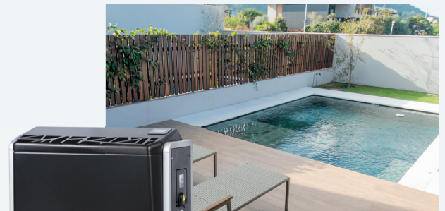
In matt black ABS 70% recycled