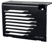
AS STANDARD : DARK ABS 70% recycled matt black

The DARK ABS front panel is fitted as standard, but the optional front panel is supplied assembled: