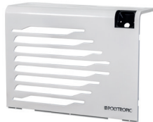
OPTIONAL : CRISTAL High-gloss white metal en option