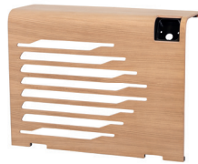
OPTIONAL : WOOD FSC wood from sustainably managed forests Untreated - to be stained.